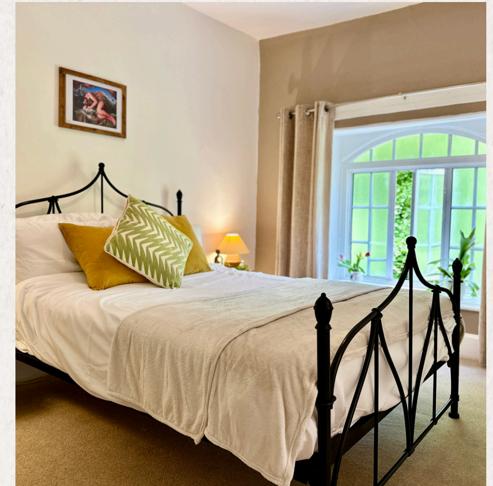
Super King En-suite